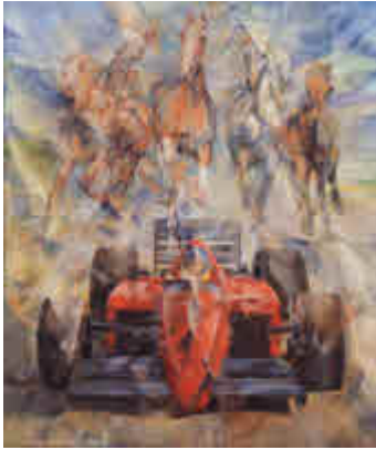
La Passione I F1 car with horses in background