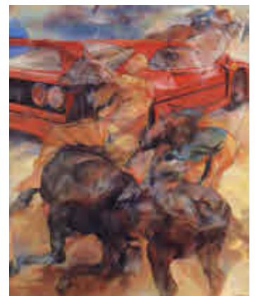
La Passione VI F-40 Berlinetta, 1987