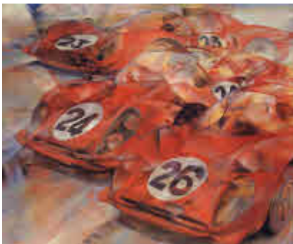
La Passione III, Car Numbers 23, 24, 26 330 P4, Daytona 1967