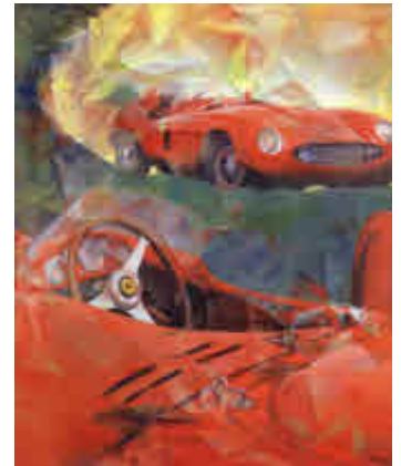
La Passione II La 121 olle 24 ore, Le Mans 1955

The boy steals the family vanilla essence (which has been banded down from their grandfather), one of the ingredients used in their home made ice cream. He has noticed girls love the smell of it and turns it into a best-selling aftershave, and with his success, he is able to chase his dream of owning and driving a Ferrari and moving back to Italy. With this success comes the realisation that it is best to enjoy passions and not to let them become obsessions. Now a prosperous businessman, he returns to England to re-unite with bis father and rekindle their relationship.