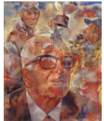
La Passione IV Portrait Enzo Ferrari