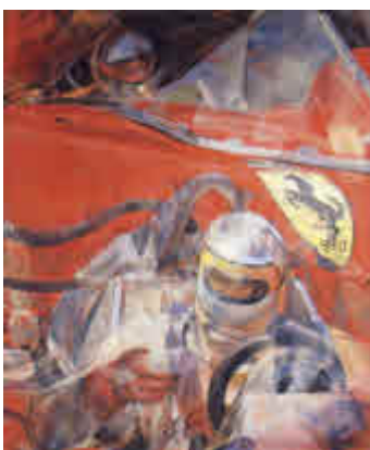
La Passione VII Jody Scheckter - Controllo dei teeufi campione del mondo 1979