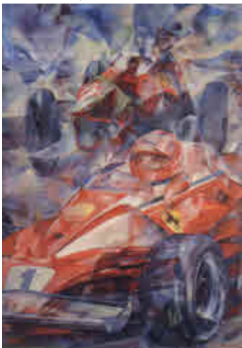
La Passione V Campione del mondo, Ascari 1952-1953, Niki Lauda 1975,